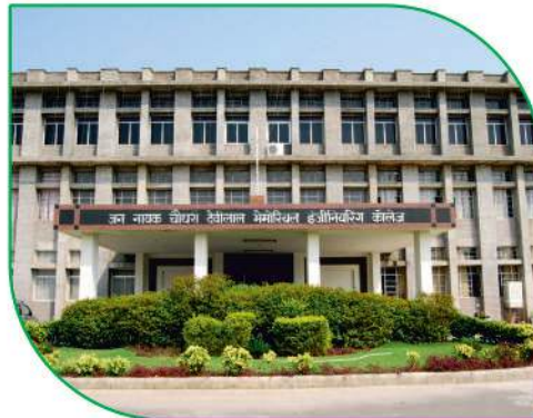
JCDM COLLEGE OF ENGINEERING