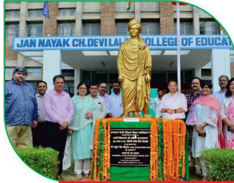
JCD COLLEGE OF EDUCATION