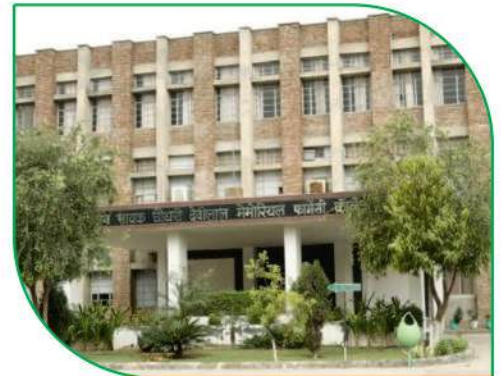
JCDM COLLEGE OF PHARMACY