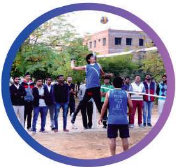
JCD VOLLEYBALL ACADEMY