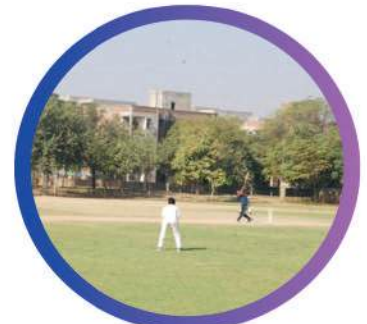
JCD NATIONAL CRICKET ACADEMY