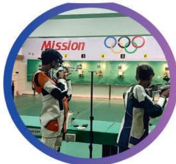
JCD SHOOTING RANGE