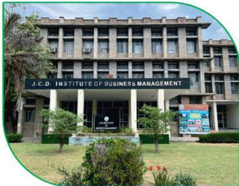
JCD INSTITUTE OF BUSINESS MANAGEMENT