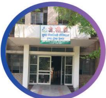
PRIMARY HEALTH CENTRE