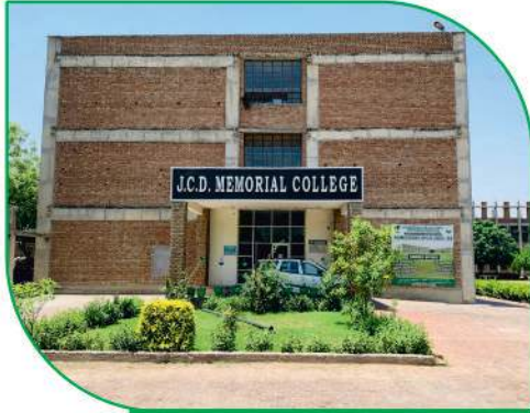
JCD MEMORIAL COLLEGE