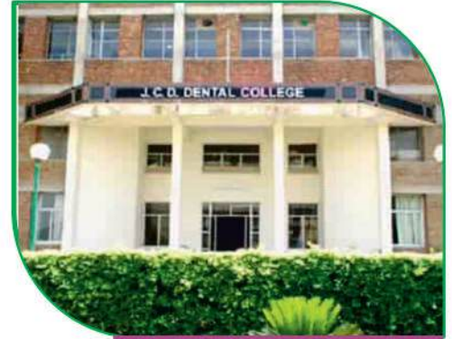
JCD DENTAL COLLEGE